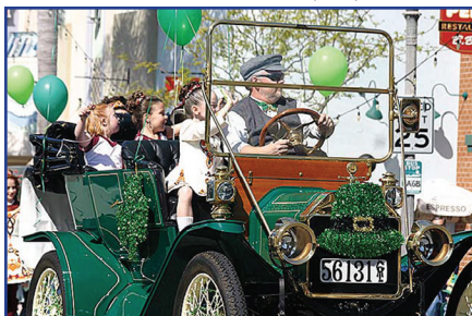
St. Patty's Day Parade, as it travels down Main Street in Downtown Ventura.