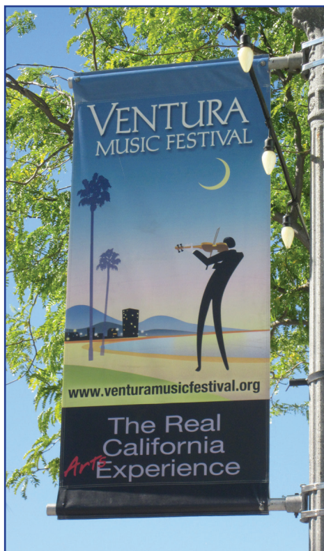
Ventura Music Festival banner adds art and beauty to the downtown streetscape.